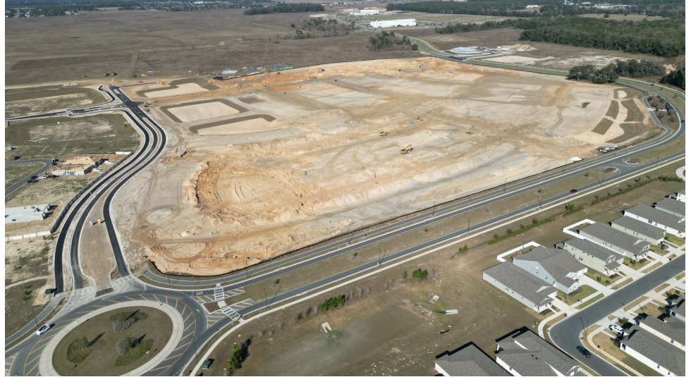
Perlino Grove, Calesa Township's newest neighborhood, selling soon!

Please be aware that parts of Sorrel Glen are still active construction zones. For everyone's