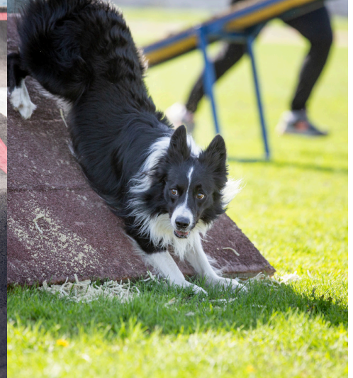
Adventure Park & Sorrel Glen Bark Park are now open!

Grand Opening Celebration hosted by the HOA.