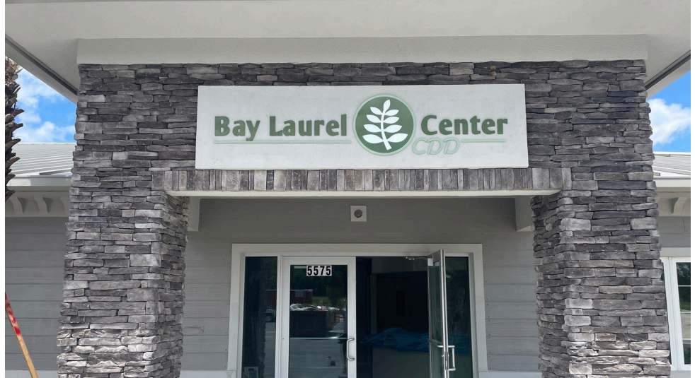
Signage is in place on the new Bay Laurel Water Treatment Facility and Calesa Township Homeowners Association building..

It has been brought to our attention, that Calesa residents are continuing to use the amenities such as the