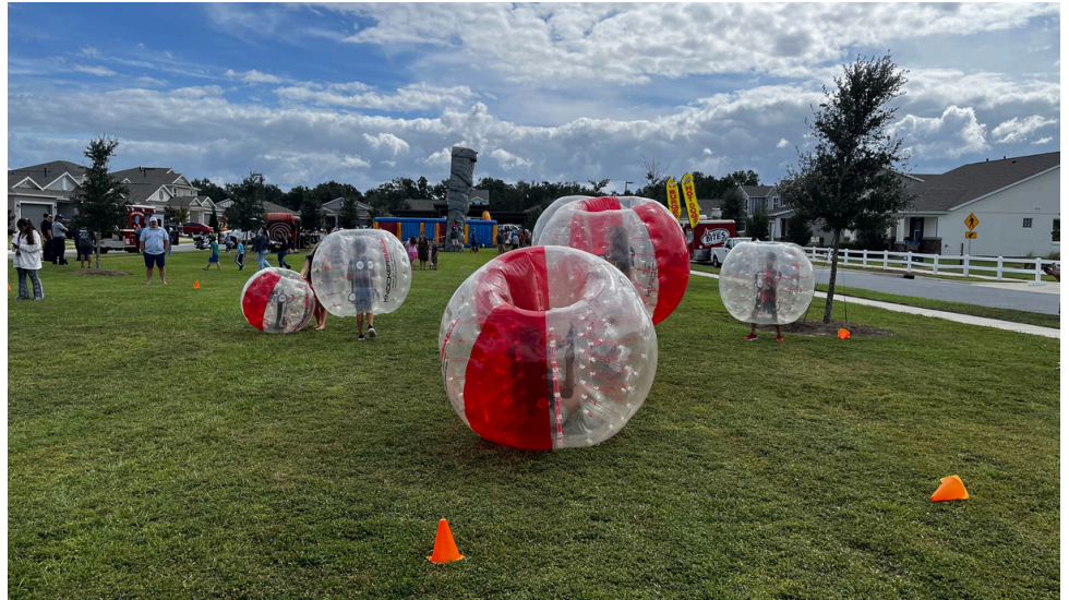
Attendees of the Calesa Township Community Block Party enjoy a round of knockerball.

In the meantime, a reminder that Sorrel Glen and its amenities