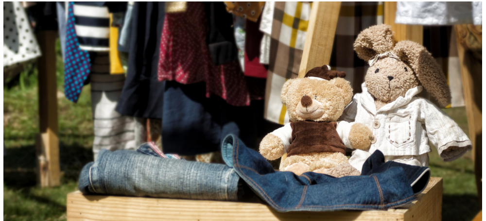
The first community yard sale is Saturday, May 20th on the event lawn next to the Emerald Pavilion.

As a reminder, Roan Hills Phase 2 and Sorrel Glen remain active construction areas and are off limits to residents. With summer approaching and kids active in the community, it is more important than ever for them to be instructed to stay out of active construction and development areas.