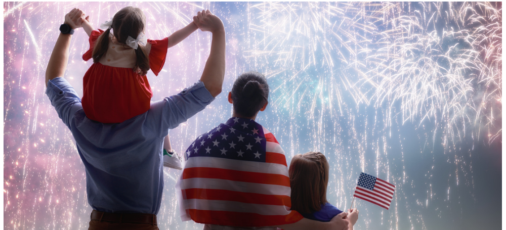
Red, White, & Boom is a private event for residents to enjoy for FREE on Saturday, July 1, 2023.