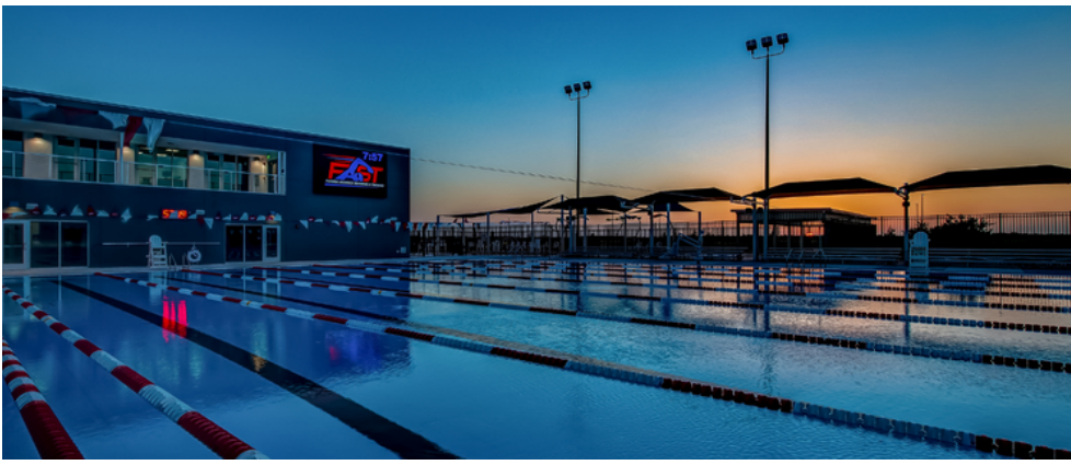
Join us for a Sunset Swim at FAST on Saturday, June 10, 2023 from 5 - 9 pm!