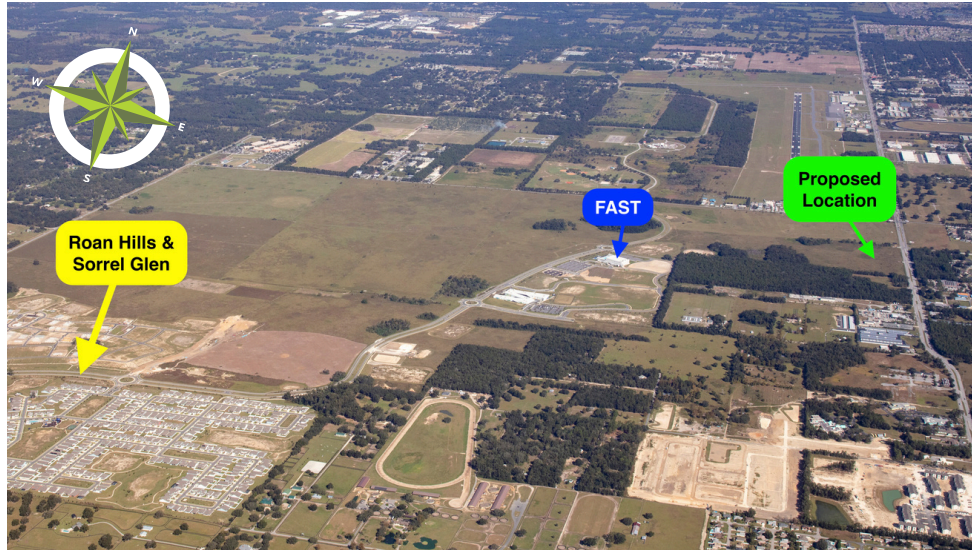
Proposed location for storage & RV/boat parking facility situated behind FAST with access to SW 60th Ave.

To clarify, the proposed location for this adjacent project is in the northeastern portion of the property, situated behind Florida Aquatics Swimming & Training (FAST), with access via SW 60th Avenue. Please refer to the image above for a visual reference. This